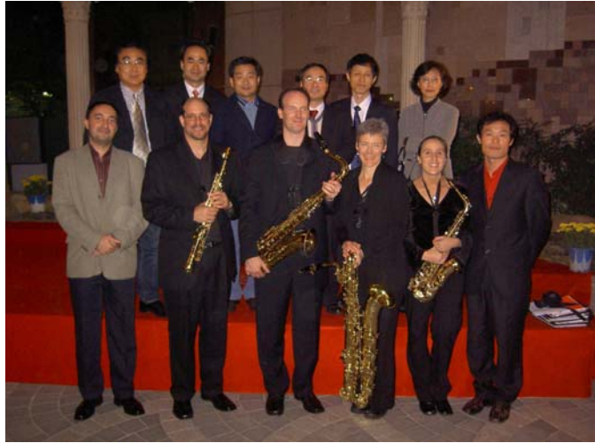
The Ancia Quartet with composers in Daegu, Korea

The Ancia Saxophone Quartet performed a concert tour of South Korea in October 2007. The tour included performances at Seoul National University, the Da-Ism New Music Festival in Daegu, the Jeong Yul-seong International Music Festival at the Gwangju Cultural Arts Center in Gwangju, as well as a concert for the Seoul Green Doctors. Ancia premiered several news works by Korean composers at the New Music Festival and presented a concert of American music at the International Music Festival in Gwangju. The Ancia Quartet is based in Minneapolis.